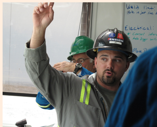
Control room technician at Pinedale Encana drilling operation

The U.S. shale gas revolution has, in a few short years, reversed decades-long U.S. trends of increasing energy dependence and growing greenhouse gas emissions. As the nation's principal energy-producing region, the Intermountain West has an opportunity to take advantage of these and related positive developments in the energy field to build a regional clean energy infrastructure.