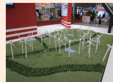
Wind power exhibit