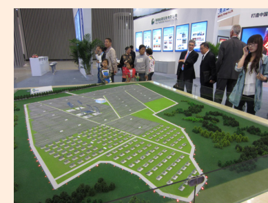
Solar power exhibit