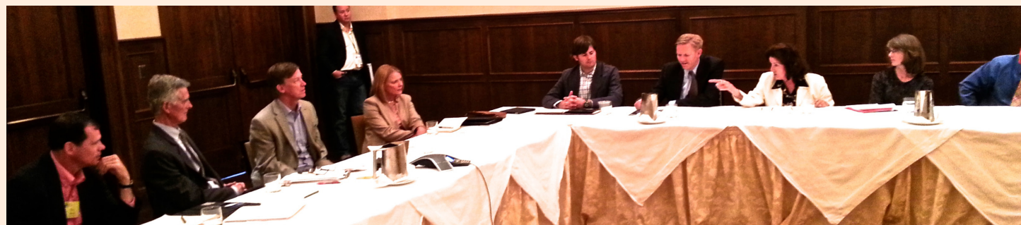
First meeting of the Intermountain West Clean Energy Initiative.