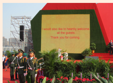
The speech given by Shanxi Governor Wang Jun projected on a screen