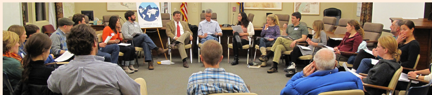
Meeting of the Next Generation Policy Group