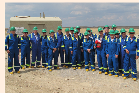
Global Business Roundtable site visit to Encana Gas drilling operation, Pinedale

In addition, JHCGA organized a field visit in August 2012 to the Encana natural gas drilling operation outside Pinedale, WY. Seventeen community members, including nine members of JHCGA's Global Business Roundtable, participated in this fact-finding visit organized by the Alberta-based company.