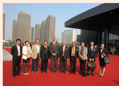
JHCGA with the Shanxi support team