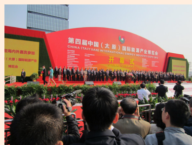
Opening Ceremony of the 2012 International Energy Industry Expo