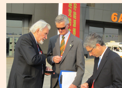
Exchanging contact information with Gustav Grob Chair, World Sustainable Energy Coalition