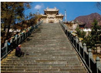
108 Steps leading to the Longquan Temple