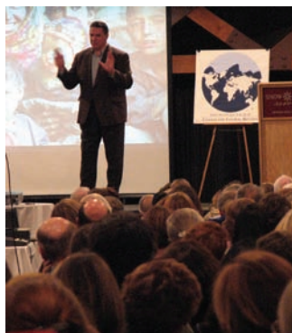
Author and humanitarian Greg Mortenson speaks at Snow King Resort.

While the U.S. has struggled to regain its footing in Afghanistan and Pakistan, educator and humanitarian Greg Mortenson has been engaged for the past 12 years in efforts to promote education for girls in those two countries. Mortenson related his efforts before a packed crowd of 800 people at Snow King Resort in a meeting sponsored by JHCGA in April 2008. JHCGA’s cosponsors included InterConnections 21, the Teton County Library Foundation, and the Valley Bookstore. Mortenson offers a full account of his experiences in his New York Times best-selling book, Three Cups of Tea .