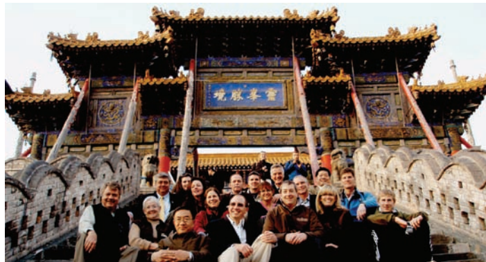
Participants in Goodwill Mission assemble on steps leading up to Pu Sa Ding Temple.