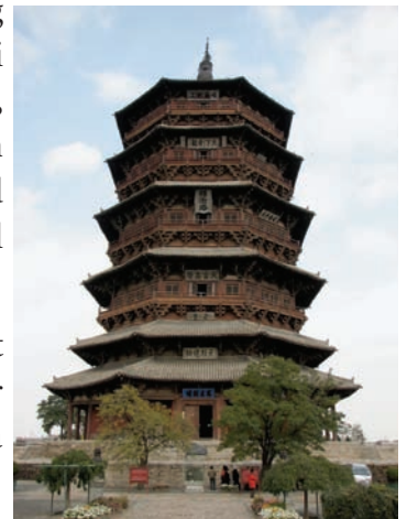
The group visited a 1,000 year-old wooden pagoda in town of Yingxian.